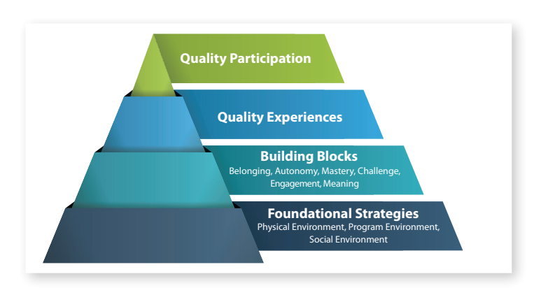
Figure 3. A schematic diagram of the Quality Parasport Participation Framework

addition, original qualitative studies were carried out with the goal of understanding the perspectives of individuals with physical disabilities regarding personal meanings of quality parasport participation and the six building blocks of quality experiences<sup>3-4</sup>, as well as the real-world strategies employed by organizations that deliver adapted physical activity experiences to enhance program quality<sup>5</sup>. Finally, input from stakeholders (e.g., CDPP researchers and community partners; external researchers and sports administrators; parasport athletes, coaches, parents) was gathered through multiple online surveys and in-person and online consultations. The research team then integrated stakeholder feedback into the framework <sup>6</sup>. Through this process, The Quality Parasport Participation Framework was developed. Centring on the six building blocks of quality experiences, the hierarchical framework is founded upon 25 evidence-informed strategies designed to foster quality experience which in turn contribute to quality parasport participation.